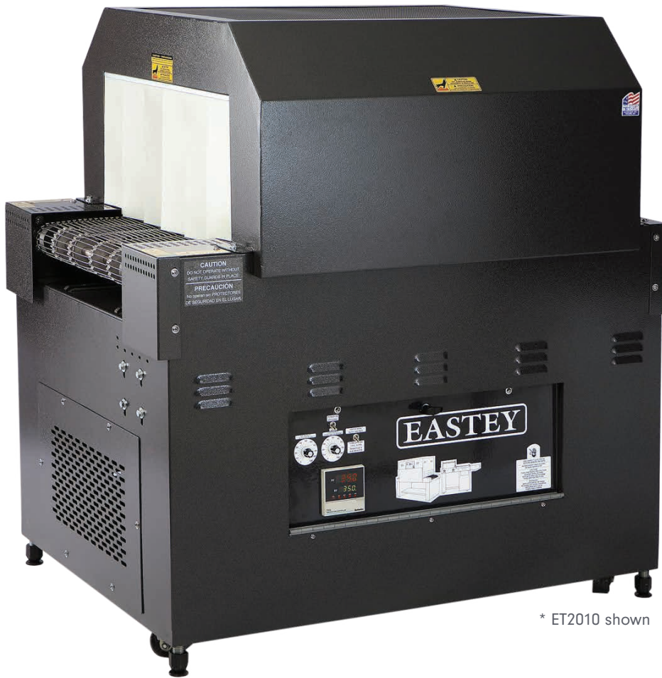
* ET2010 shown