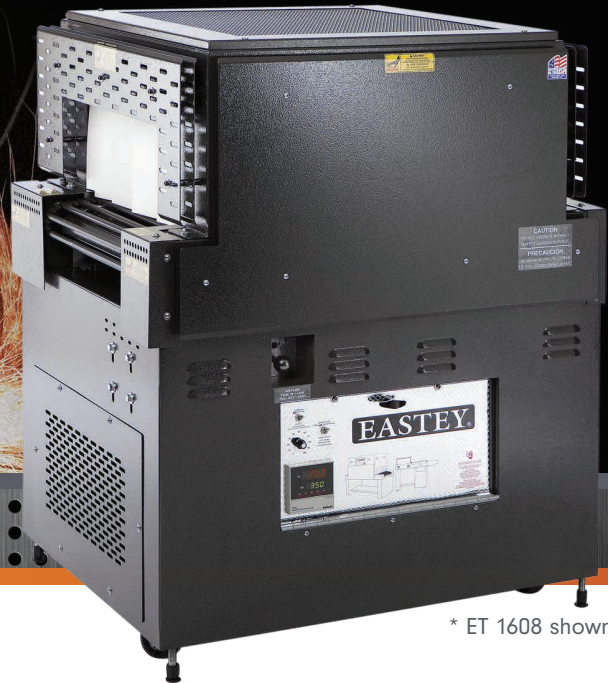
* ET 1608 shown