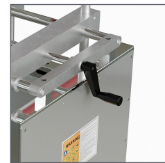
Aluminum crank handle