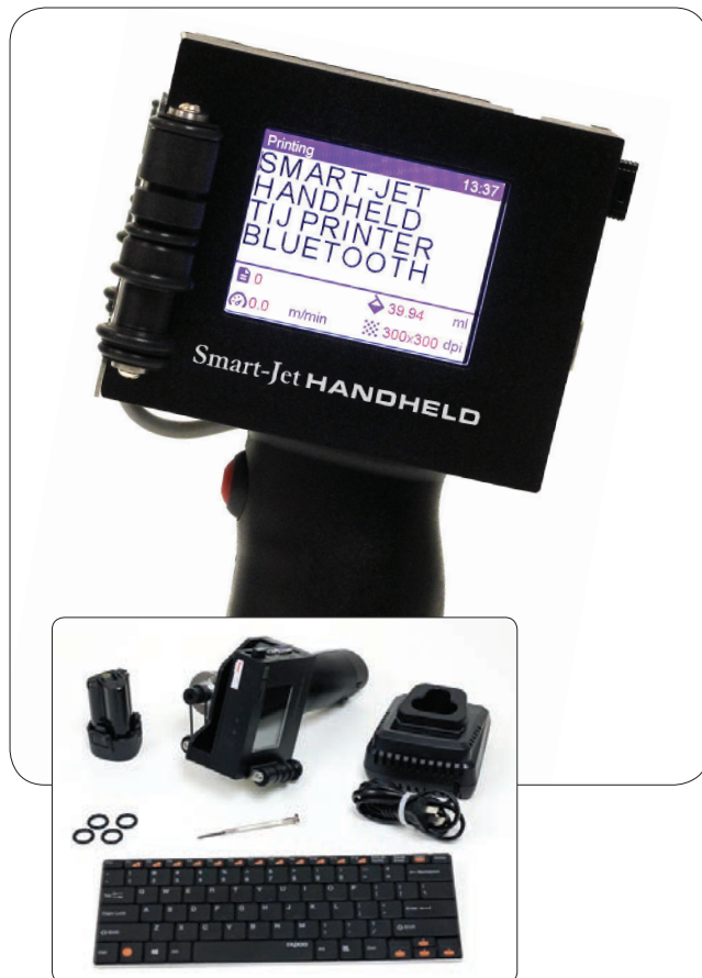
Pieces included in package