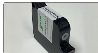
TIJ 1" cartridge technology