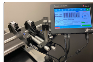
Connect up to 2 printheads at one time