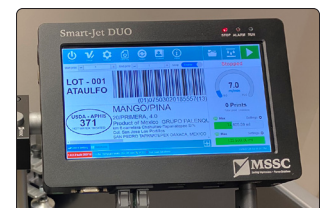
Message on 7" Touchscreen