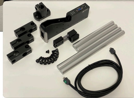
Pieces included in each printhead box