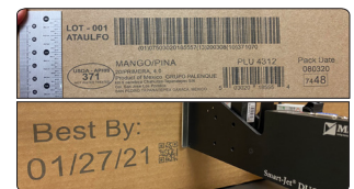
Porous and non-porous print