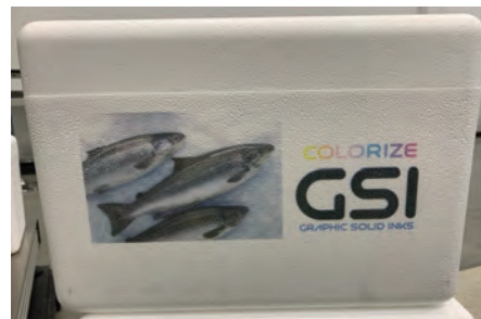
All technical specifications are preliminary

Vision System Any brand Alarm Beacons Per customer request Customizations of Systems Integrations