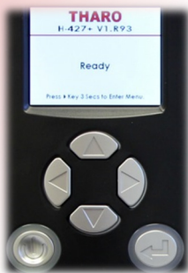
Color LCD and button panel for easy configuration

From the creators of EASYLABEL® the Tharo H-Plus Series is a robust industrial barcode label printer in the mid-level price range.