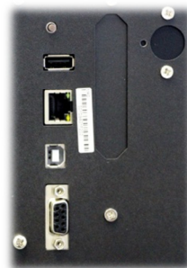
Multiple interface ports standard USB host port for standalone