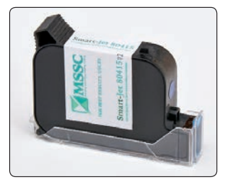
TIJ cartridge technology