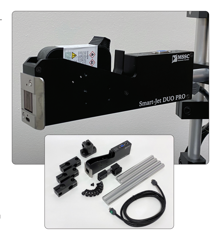
Pieces included in each printhead box