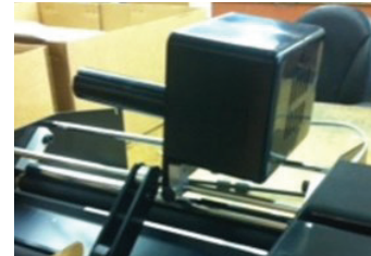
BMR-6 Product Detail